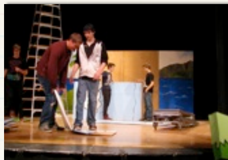
Some of the construction technology class taking the show down and "striking" the lights.